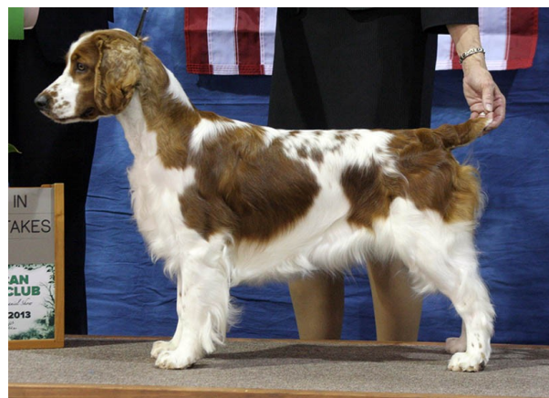
Ky-Bryn's Wheel in the Skye "Journey"